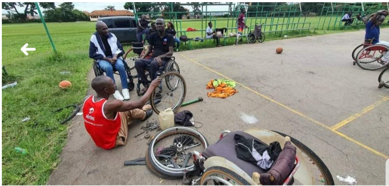
The photo above shows the condition of the wheelchairs in use

The wheelchairs we use are old with spare parts from bicycles and skate shoes, welded by people without expertise in welding sports wheelchairs and lack basic safety features like straps and cautions. Such challenges demotivate athletes and scare away potential athletes sighting a high potential of sustaining injuries especially to victims spinal cord injury.