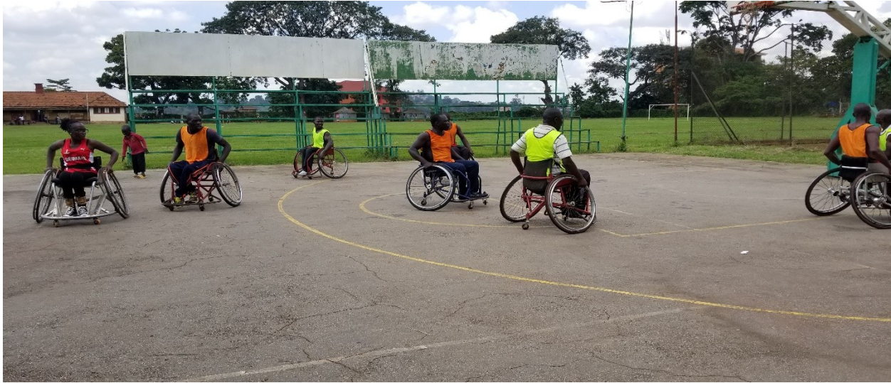
This is Makerere sports ground found at Makerere University where we train and play.