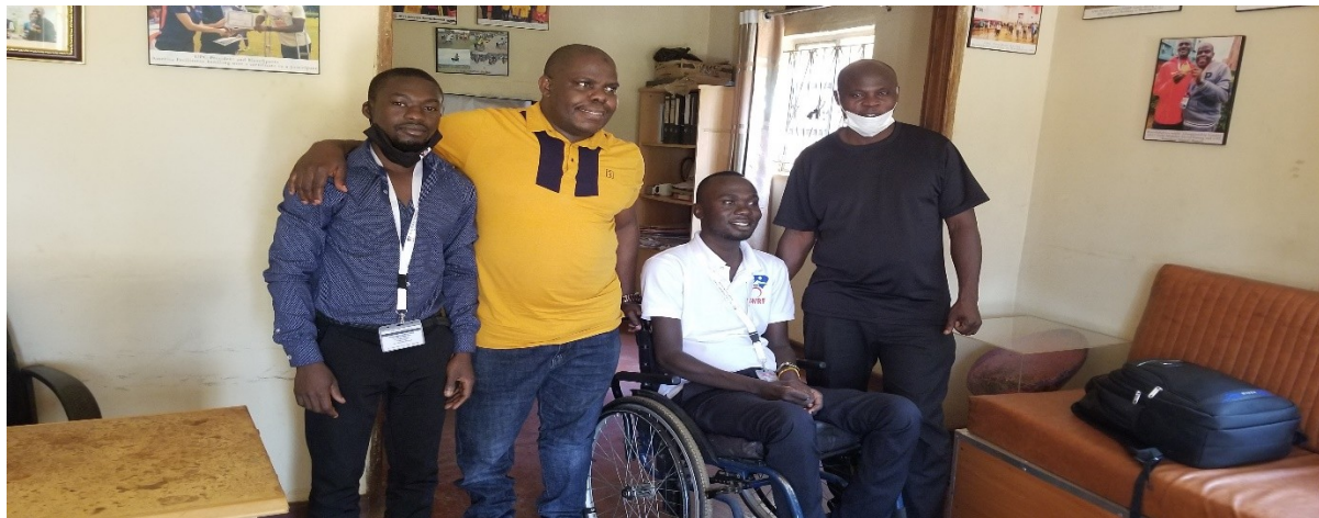
At the Uganda Paralympic Committee offices located at Mulago.

On 19th November 2021 during the Uganda Paralympic committee general assembly, the wheel chair rugby foundation Uganda officially became a member of Uganda Paralympic Committee a national governing body of Para sport in Uganda. This process of affiliating with Uganda Paralympic committee started back in June 2021 and we are glad that by November we successfully managed to affiliate with UPC has planned in our annual work plan.