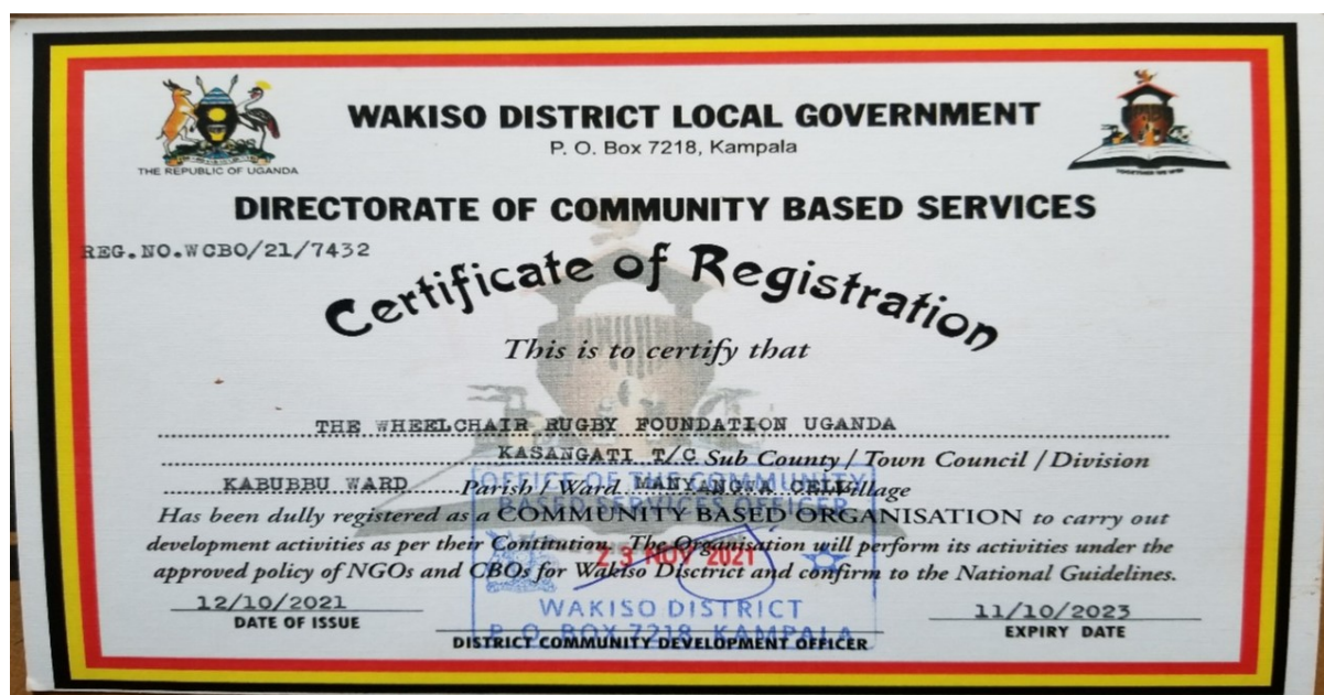
Caption of the UWRF original CBO certificate.

We are glad that the wheelchair rugby foundation Uganda is fully registered CBO with Wakiso District under registration number REG.NO.WCBO/21/7432.