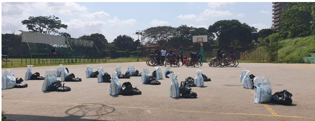
Food relief for UWRF athletes during the lock down

Every athlete received 5kgs of maize flour, 1kg of Sugar, 2kgs of Rice and 2kgs of Beans as presented in the photos above.