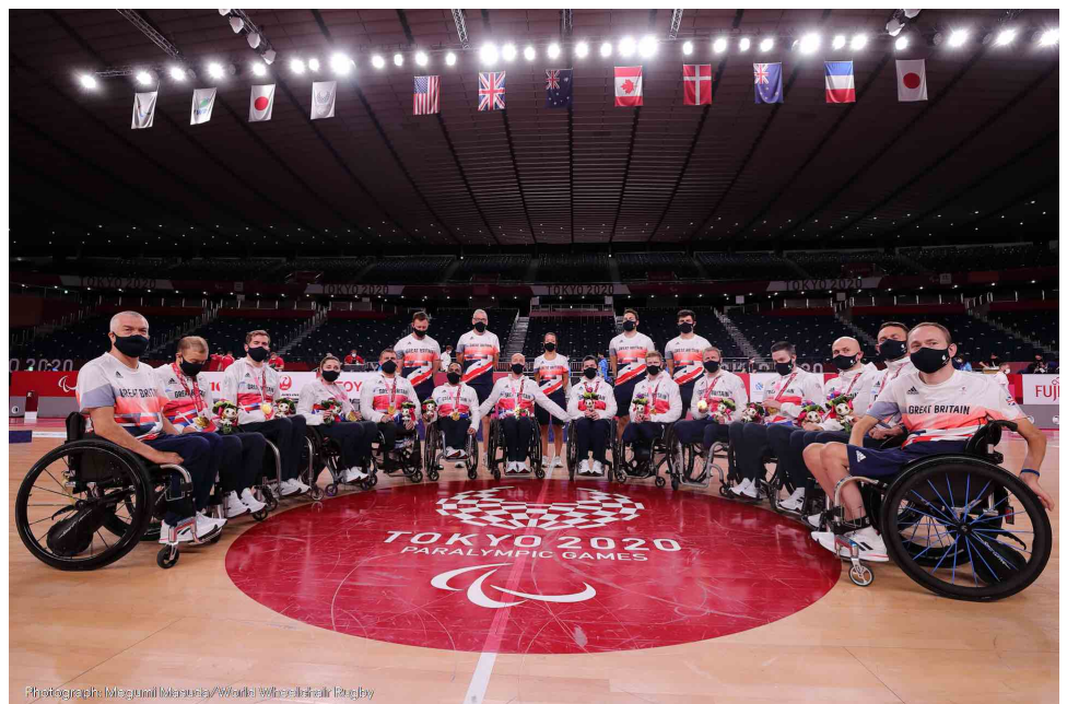
Tokyo 2020 Gold Medallists – Great Britain

First European team to win a medal at a major Championship.